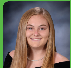
Aubrey Thomas Canyon High School